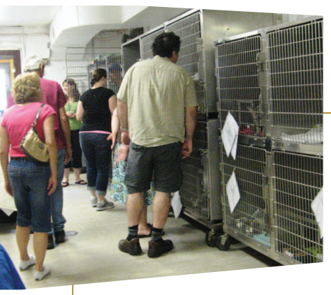
Looking for cats at Feline Fest