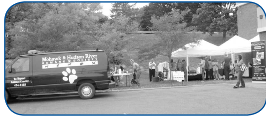
Price Chopper Niskayuna Pet Day

Thousands of people attended these adoption events, which were hosted by dozens of area organizations and businesses. Hundreds of homeless animals found new forever homes