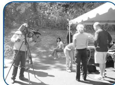
YNN at Martin Harding & Mazzotti

Tawasentha Park ; enjoyed a sunny Friday at TD Bank in Latham , where thousands of cars saw our "Got Pets?" signs and adoption clinic; participated in the annual New Jerusalem Church Block Party in downtown Albany and an adoption clinic at the Sidney Albert Jewish Community Center ; joined in Albany's First Friday celebration at the Broadway Arts Center ; and, of course, were thrilled to have a mid-September adoption clinic at Martin, Harding & Mazzotti .