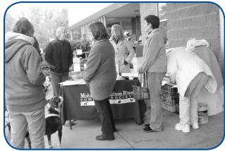
Price Chopper East Greenbush

We also spent time in Schenectady County at the APF’s Fireplug 500 Walk and at the Niskayuna Price Chopper’s Pet Event , where we held a low-cost rabies vaccine clinic and adopted out several cats and kittens.