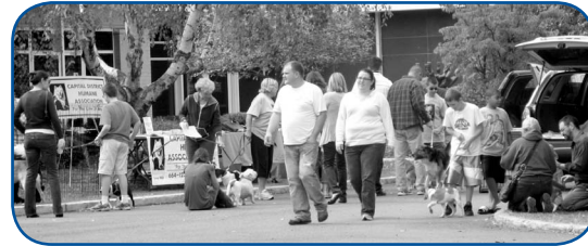
JCC Event in Albany