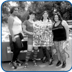
Feline Fest, Roller Derby Gals