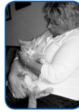
Guilderland Animal Hospital