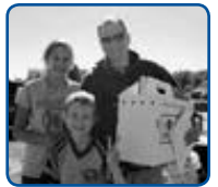
Schuyler Farm Corn Maze adoption