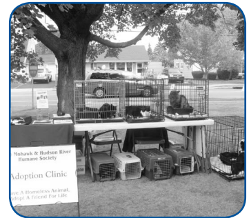
JCC Event in Albany