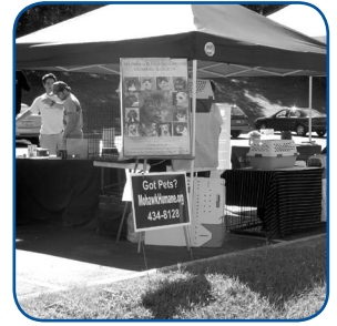
TD Bank on Route 9, Latham