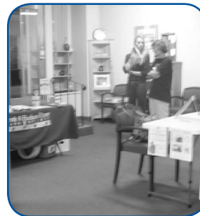
First Friday at the Broadway Arts Center

busy adoption Sunday at Price Chopper on Central Avenue; attended the Living Resources' Traumatic Brain Injury Day at