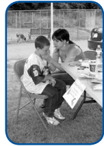
Feline Fest, Face Painting