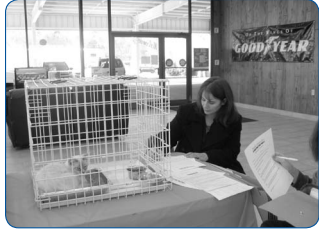
Cat Adoption at Advantage Subaru

“Bark in the Park” in early August at Joe Bruno Stadium showcased some of our dogs to over 3,000 people and we saw the Tri-City Valley Cats baseball team move a game closer to their championship year. That was just the start of our Rensselaer County travels. We took part in Sage Fest on the Russell Sage College campus in Troy and the 3rd annual Pet Festival at the Schaghticoke Fairgrounds , and held adoption clinics at LaCorte Companies in Lansingburgh, Advantage Subaru and Price Chopper in East Greenbush, and the Buy Local Bash and Troy Night Out in downtown Troy.