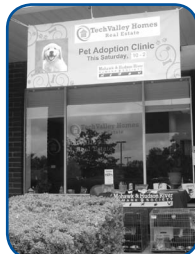
Tech Valley Homes