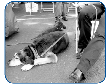
New Buddies at Martin Harding & Mazzotti