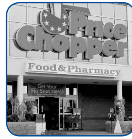
East Greenbush Price Chopper