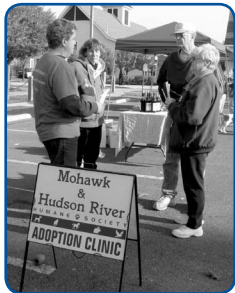
Adoption Clinic at Colonie Farmers Market