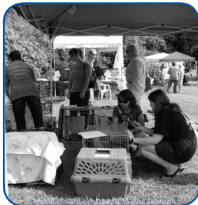
The Animal Hospital