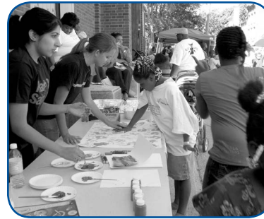
New Jerusalem Community Block Party